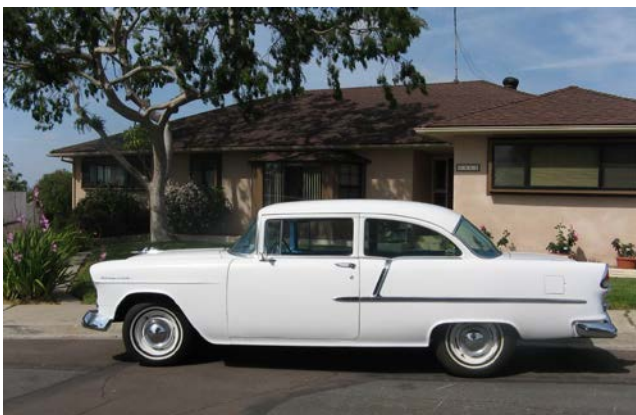
1955 Chevrolet 210 Sedan (Jim Price)