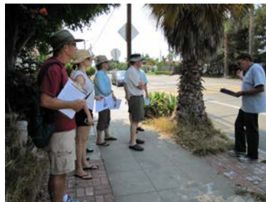
On Upas St. near Granada Ave.