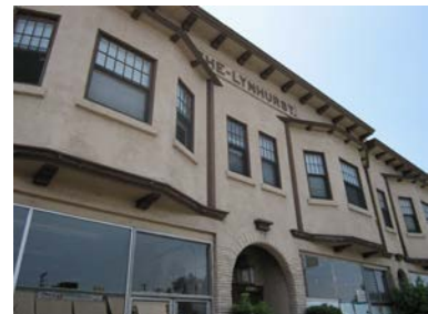
The Lynhurst Building on 30th St.