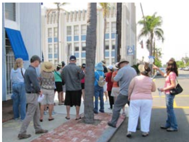
At the Masonic Lodge on Utah St.