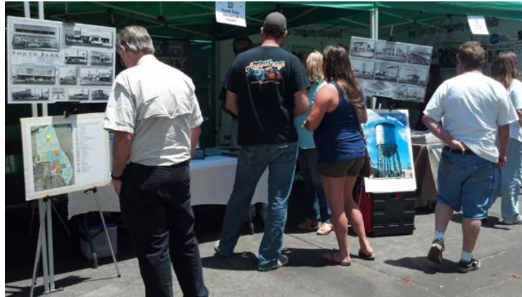
Our posters are always a big draw at events.