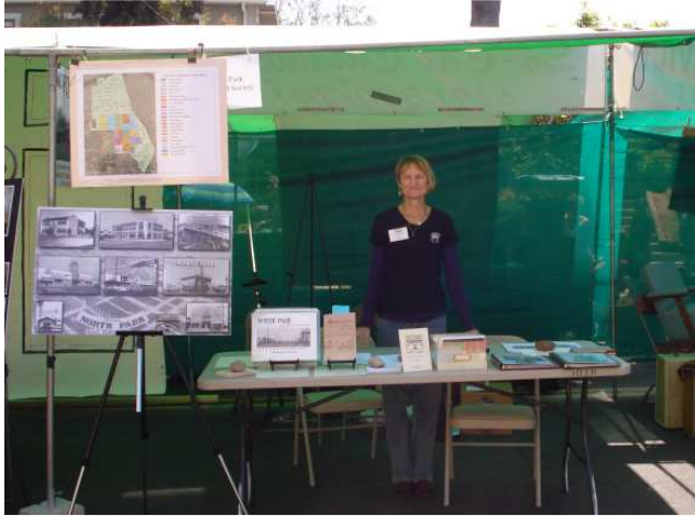
Our posters, books, note cards and binders with activities and articles on display.