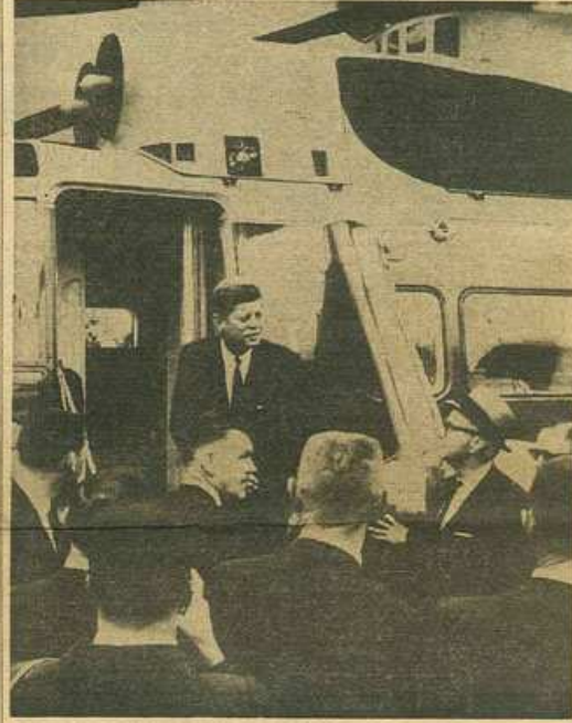
HAVING RECEIVED HIS HONORARY DEGREE, made his address to graduating class at San Diego State College, posed for press photographers and shaken hands with numerous "fans," President Kennedy pauses just before boarding helicopter to U. S. Marine Corps Recruit Depot where he inspected Marine recruits undergoing training.