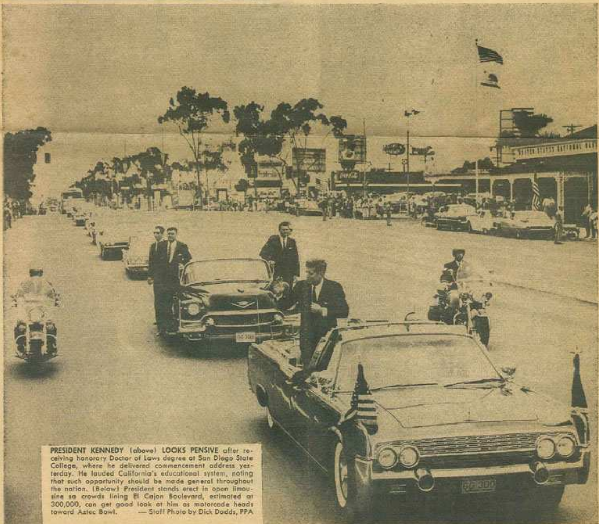
PRESIDENT KENNEDY (above) LOOKS PENSIVE after receiving honorary Doctor of Laws degree at San Diego State College, where he delivered commencement address yesterday. He lauded California's educational system, noting that such opportunity should be made general throughout the nation. (Below) President stands erect in open limousine so crowds lining El Cajon Boulevard, estimated at 300,000, can get good look at him as motorcade heads toward Astec Bowl.