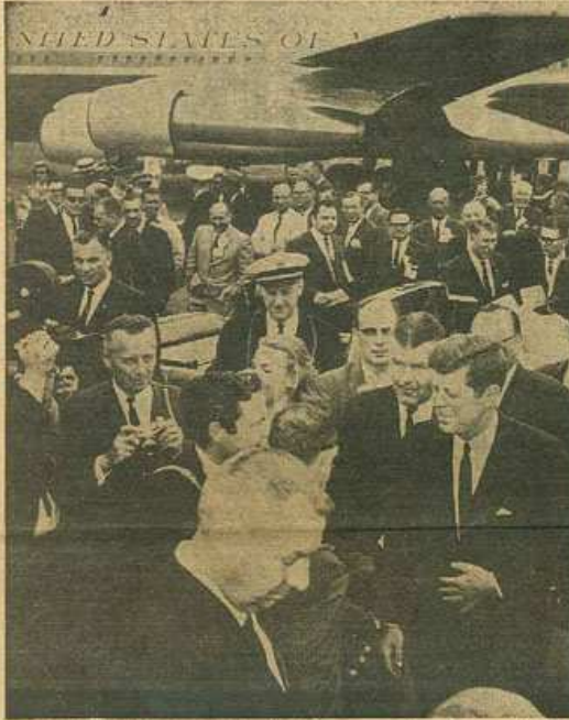
REPRESENTATIVES OF EVERY TYPE OF news media, military and civil dignitaries swarm about President Kennedy on his arrival at Lindbergh Field, San Diego, yesterday morning. Press representatives were present by the hundreds, including local newspapers, TV and radio stations, and full complement of White House representatives.