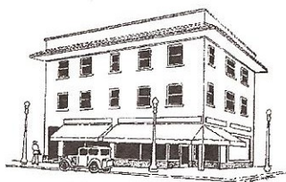
The Stevens Building

Stevens & Hartley established themselves as North Park's first real estate firm in 1905 and built its first high-rise commercial structure, the Stevens Building, on the northwest corner of 30 th and University in 1912. From that beginning, the community got its symbolic place-name Thirtieth & University, ten years later, the heart of San Diego's busiest commercial center outside the main business district.