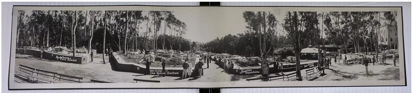
Panorama photo of the Klicka Modeltown exhibit at the 1935-36 Exposition, part of the displays by the City Clerk Archives in the City Hall Lobby for Archives Month.