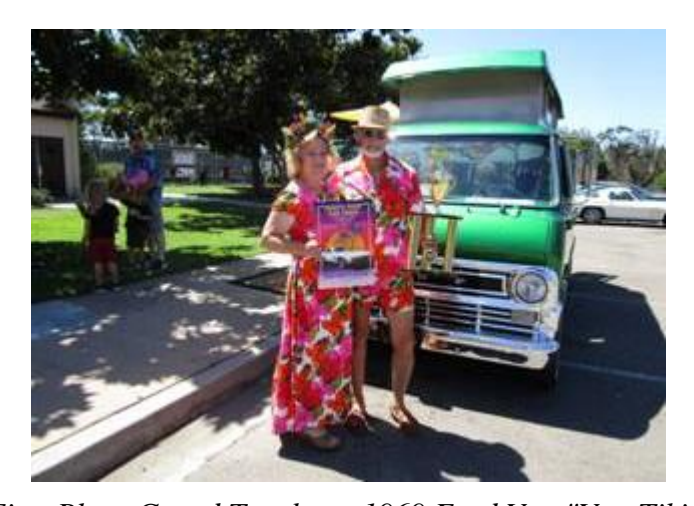
First Place Grand Trophy to 1969 Ford Van "Van Tiki."