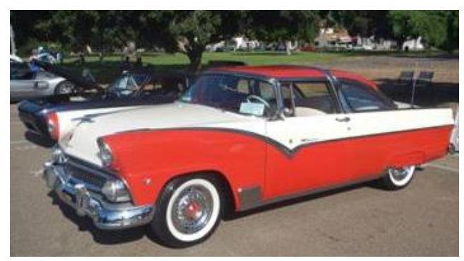
Second place to red-and-white two-tone 1955 Ford Fairlane Crown Victoria.