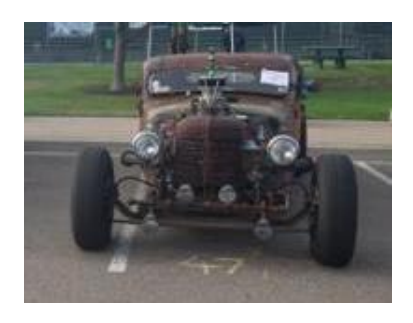
Third place tie between green 1969 Chevrolet Camaro SS 396 RS and a crazy 1946 GMC Truck "Rat Rod" that looked like something from the Mad Max movie.