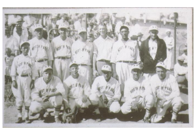
The North Park Grays baseball team