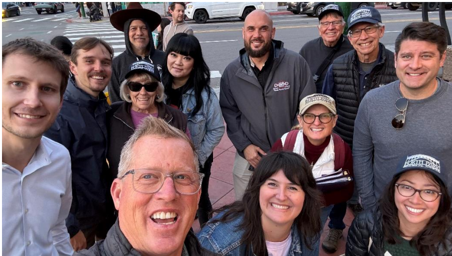
You can identify North Park Historical Society members by our cool ballcaps!