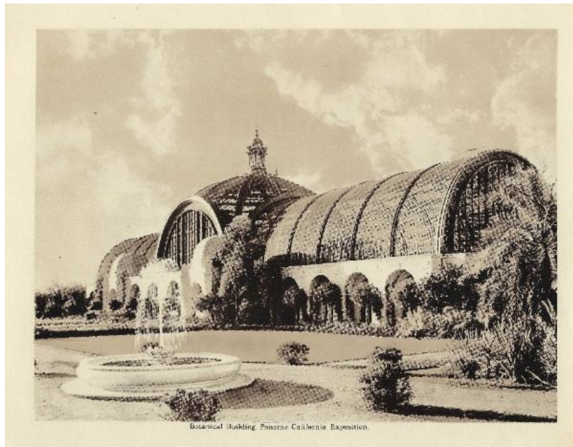
Botanical Building, currently undergoing restoration