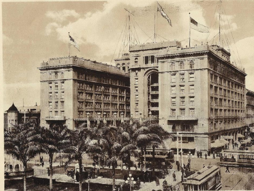
U. S. Grant Hotel, facing Plaza Park. Constructed at a cost of $2,000,000. Erected by U. S. Grant, Jr. as a memento to his father General U. S. Grant.

We are in the process of scanning slides and notebooks with photos and notes from the Covington Family and other sources. The scanned photos from the 1915 Exposition booklet, which included pictures from downtown San Diego and environs, continue to fascinate, so here are a few more.