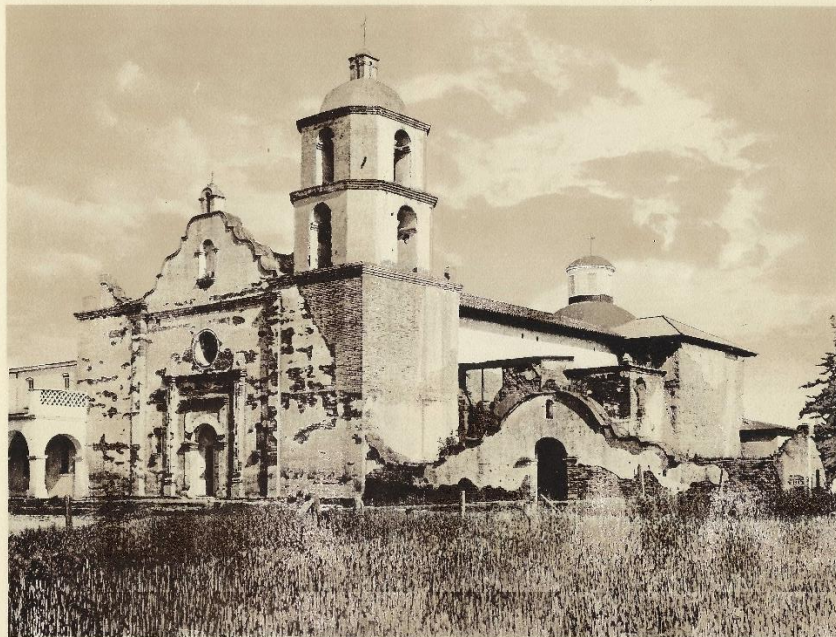
Mission San Luis Rey, 1798, situated near Oceanside some 50 miles from San Diego.