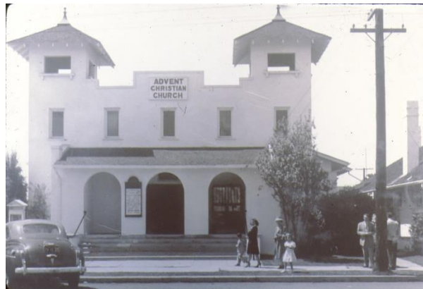
Church in 1946