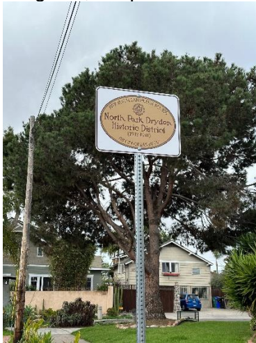
On Upas near 28 th