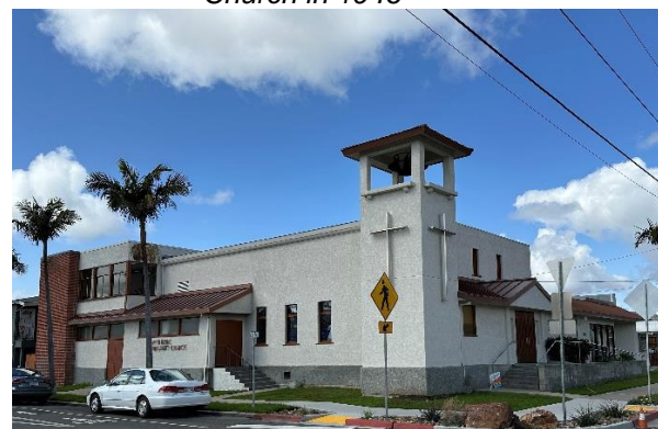
Now North Park Community Church in 2024