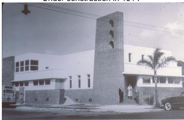
Church in 1948 after remodeling