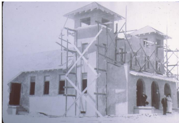
Under construction in 1914