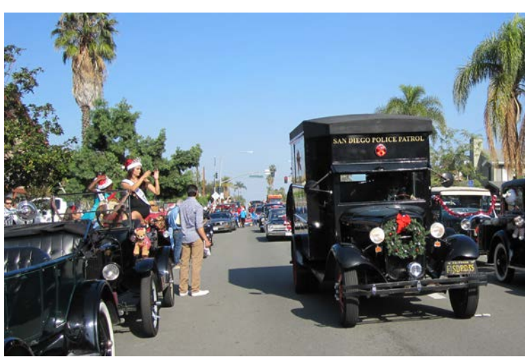
NPHS Meeting Notes 11-20-14