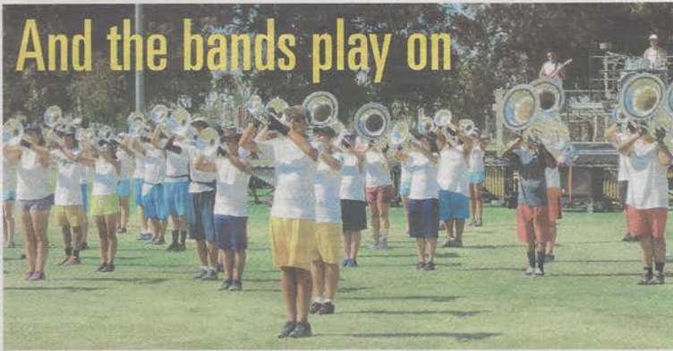
The horn section of Gold Drum and Bugle Corps play it loud and proud at Morley Field as they prepare for their upcoming national competition.