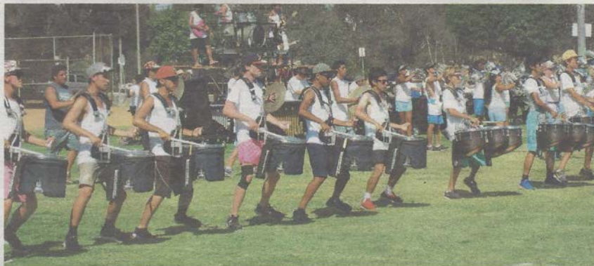
The drum section of Gold Drum and Bugle Corps move to the beat during practice at Morley Field.