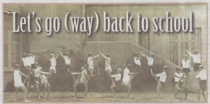
(clockwise, from left) McKinley students build human pyramids; the original school building the opened Feb. 2, 1925 and stood for nearly 50 years; and playground games under a teacher's watchful eyes