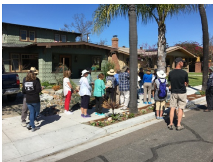
Walking tour for Osher students