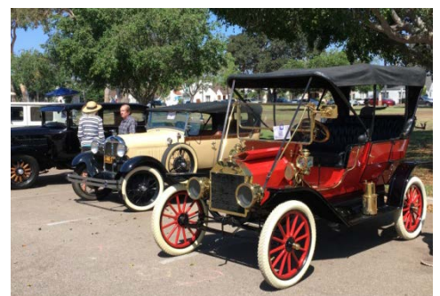
1909 Ford Model T at the 2016 Car Show