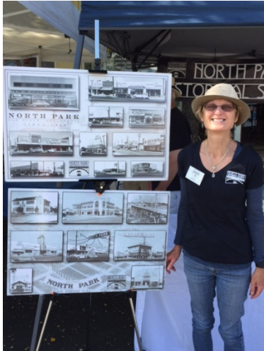
People always stop to study these historic photos of North Park.