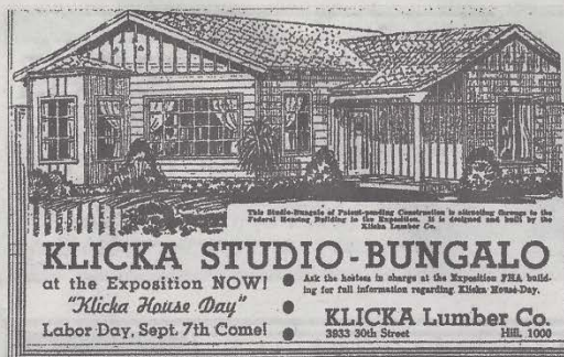
This Klicka Lumber Company advertisement announced "Klicka House Day" on Sept. 7, 1936.

The kit house was introduced as a model home at the 1935-36