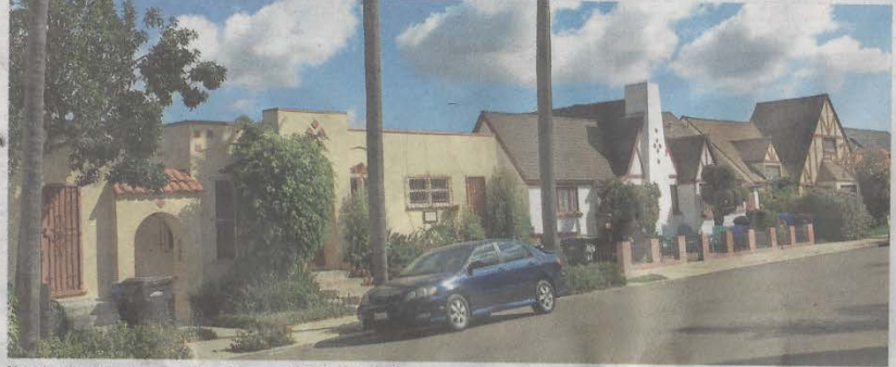
Nearly all of the homes along the east side of Georgia Street in the Wilshire Terrace subdivision have retained their historic integrity from when they were first built in 1926.