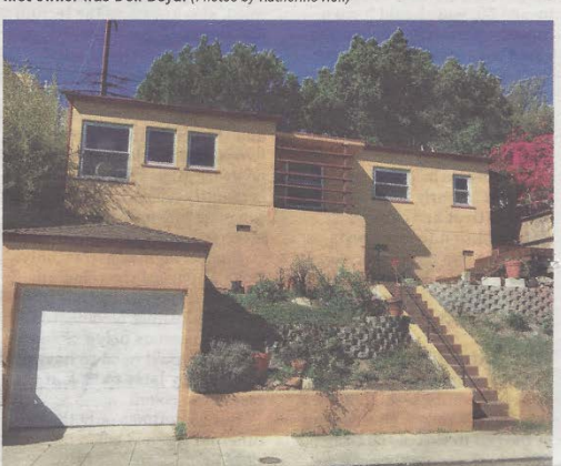
The house at 3544 Wilshire Terrace was the second to be offered in the 1938 development by the Wilshire Building Com