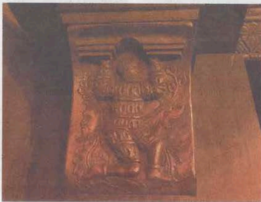
The carved wooden figures trimming the doorways of the current Red Fox Room may be more than 450 years old.