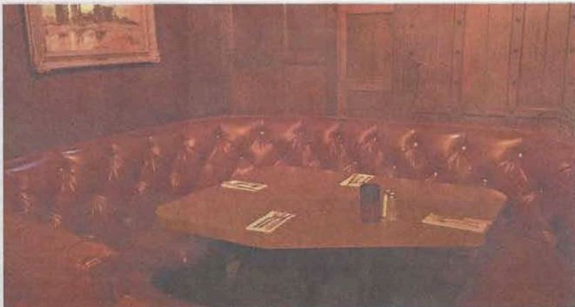
Jim Demos intends to recreate the cozy ambience of the Red Fox Room in a new location.