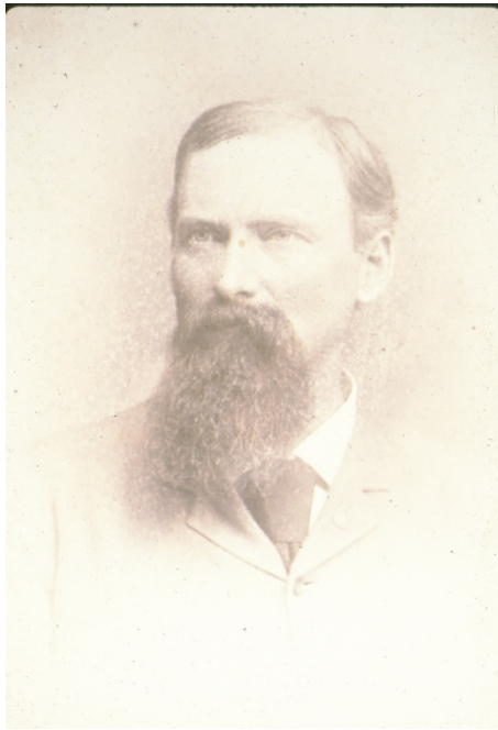
James Monroe Hartley, 1890