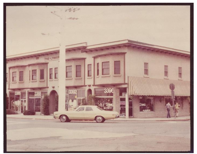
The Lynhurst Building on the southwest corner of Upas Street and 30<sup>th</sup> Street.