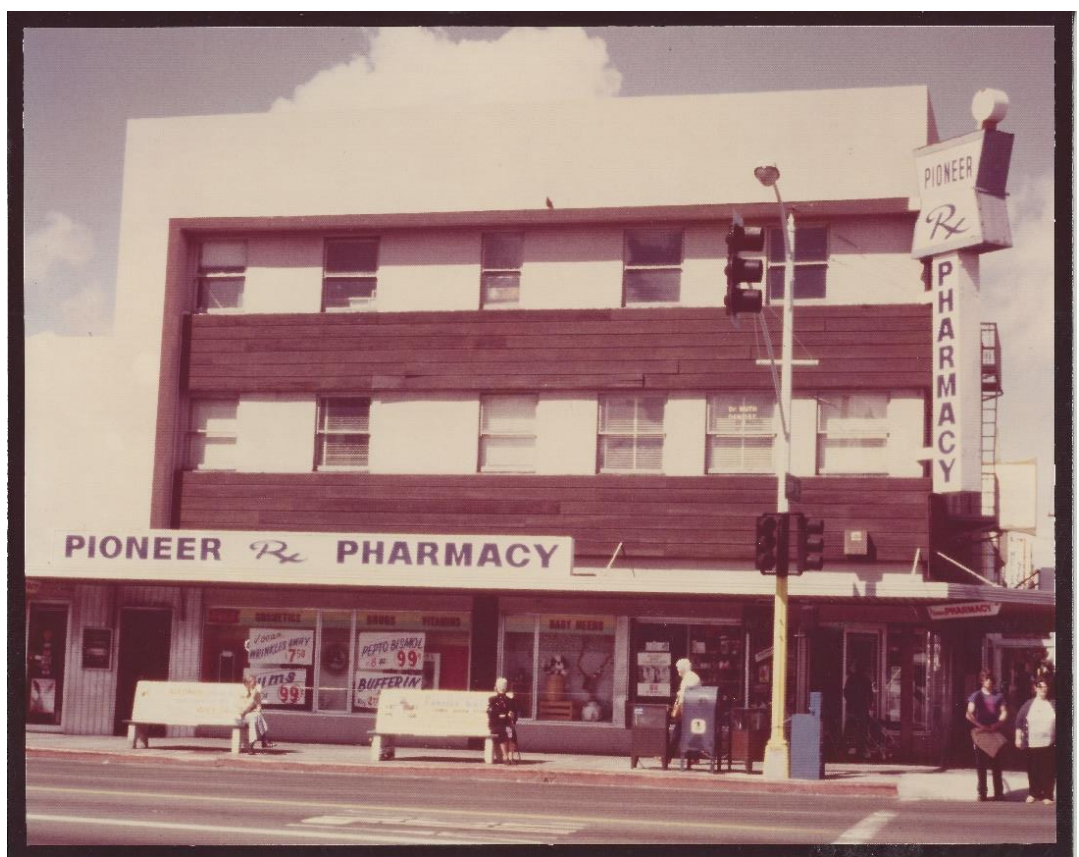
Pioneer Pharmacy on the northwest corner of University Avenue and 30<sup>th</sup> Street. Now the Western Dental building.