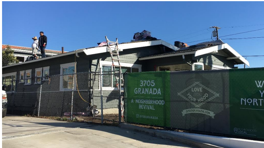
As of February 24, 2022: the house has been painted, windows are installed, and roofing is in process.