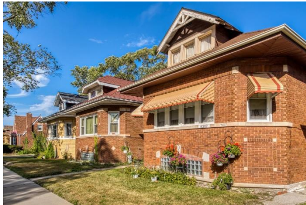
About a third of Chicago's single-family housing stock consists of bungalows like these, built by the tens of thousands in the early 20th century.

The Bungalow Home Design That Unifies Chicago - Bloomberg