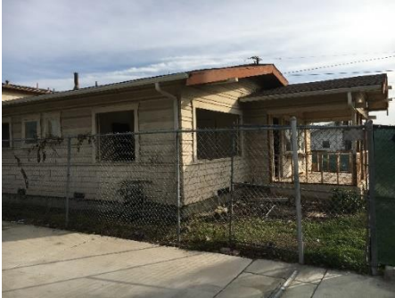
House at the start of restoration.