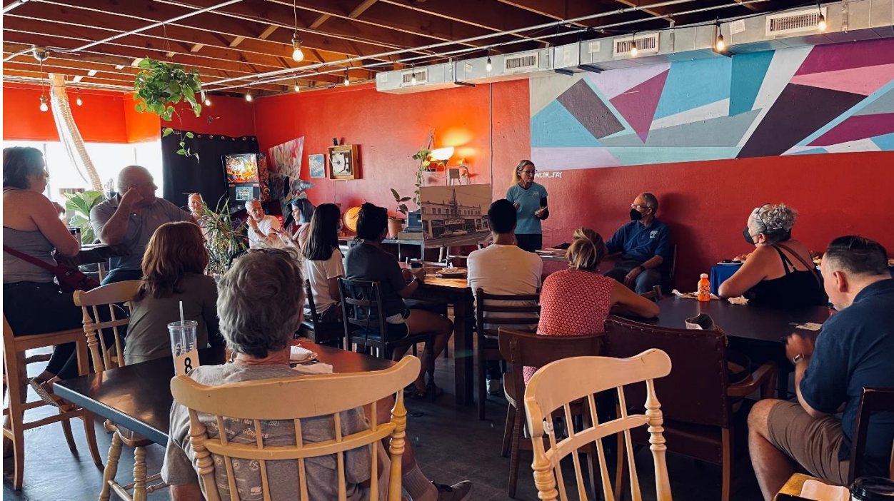
Subterranean Coffee Boutique arranged a nice space for the presentation. Also, the coffee and pastries were delicious!