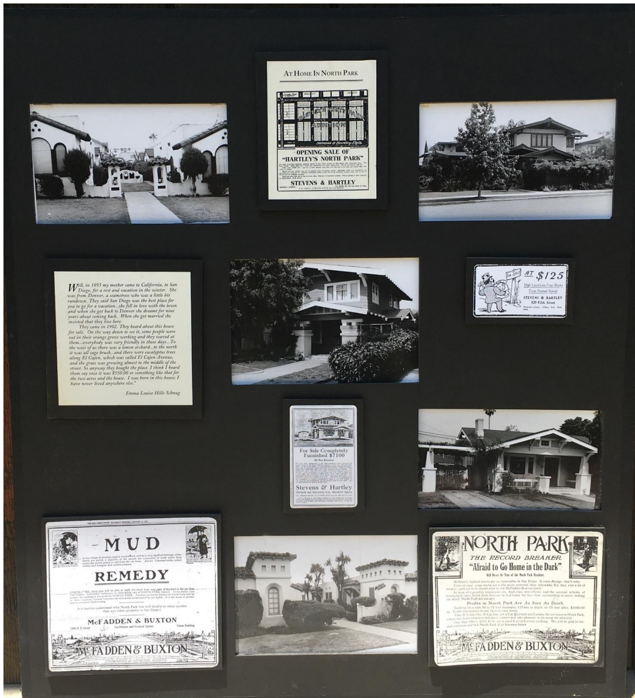
This poster was likely made for presentations during the 1996 Centennial events for North Park.