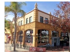
29 th and University