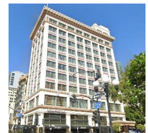
5 th and E