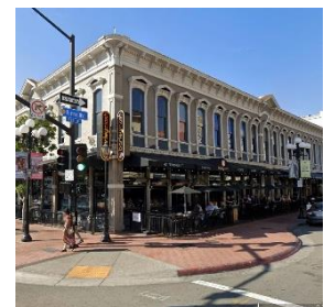
5 th and Market