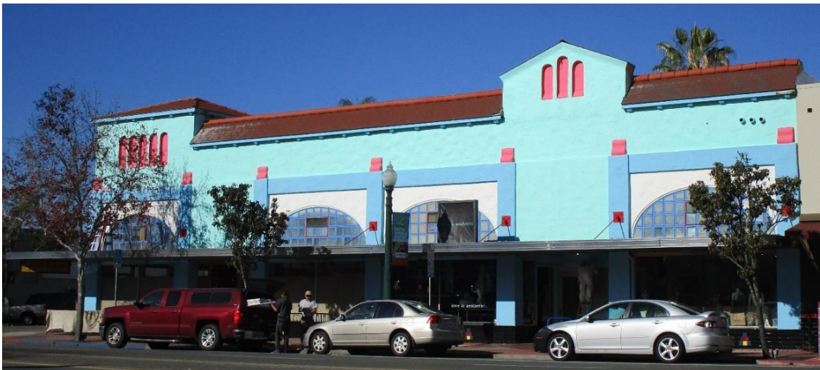
The “Claire de Lune” building at Kansas Street and University Avenue in 2017