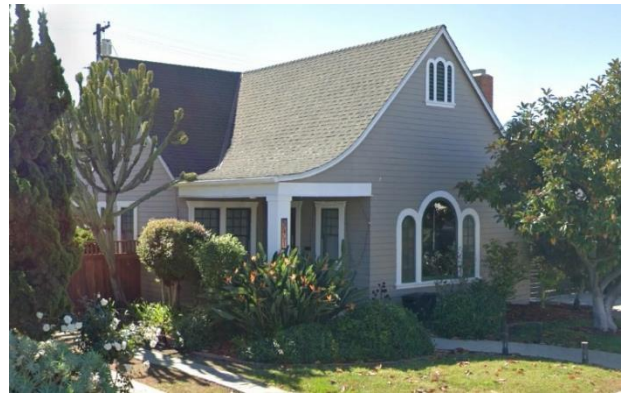
3461 Olive Street