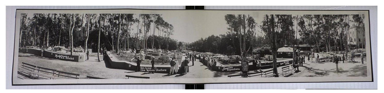
Panorama photo of the Klicka Modeltown exhibit at the 1935-36 Exposition, part of the displays by the City Clerk Archives in the City Hall Lobby for Archives Month.