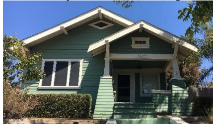
Among the house styles highlighted on the tour are (from left) Tudor Revival, Spanish Revival, and Craftsman.