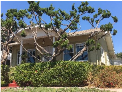
NPHS Meeting Summary 6-20-2024