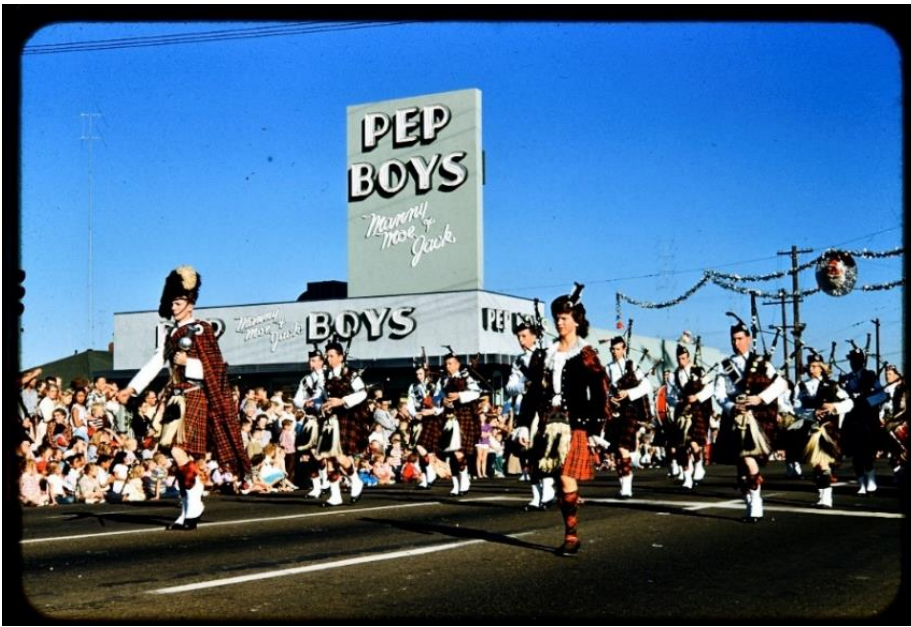
Helix High School marching band near 32 nd Street