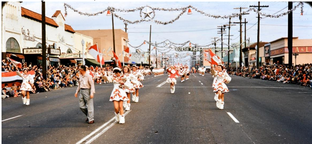
This street scene is looking east from around 29 th Street and University Avenue.