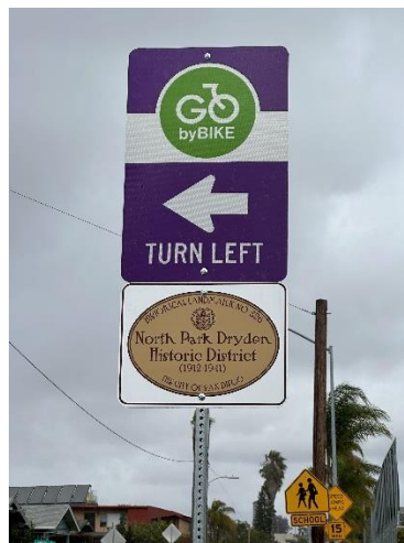
On 28 th near Landis