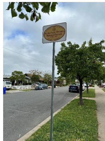
On Pershing just north of Upas