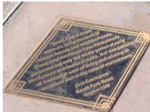
Plaque at the "Portal" to the Dryden District Upas and 28th streets