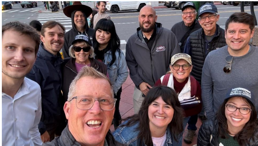
You can identify North Park Historical Society members by our cool ballcaps!