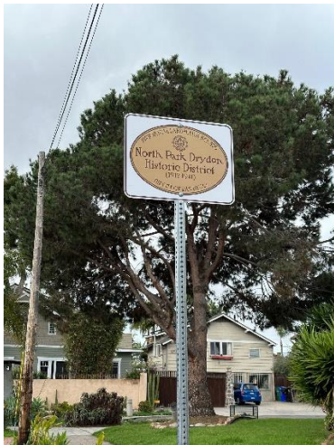
On Upas near 28 th